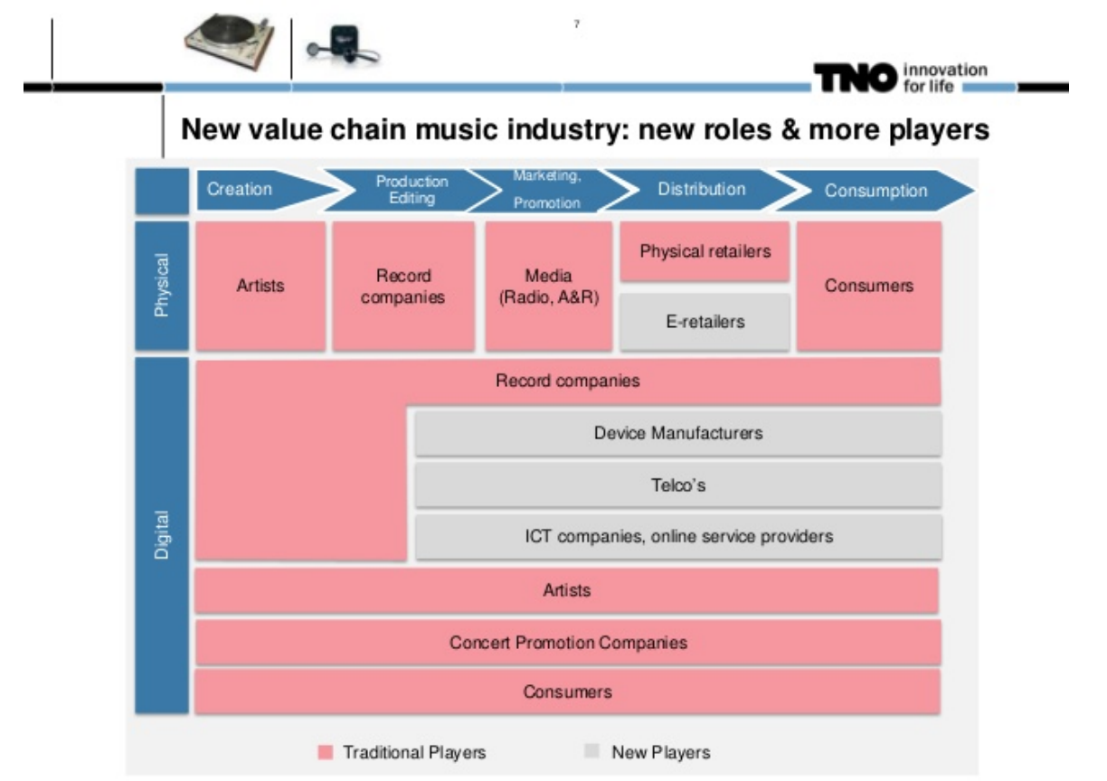
Exhibit 2: changing value chain in the global music industry