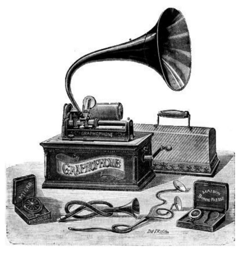
Drawing by Norman Bruderhofer via Wikimedia Commons