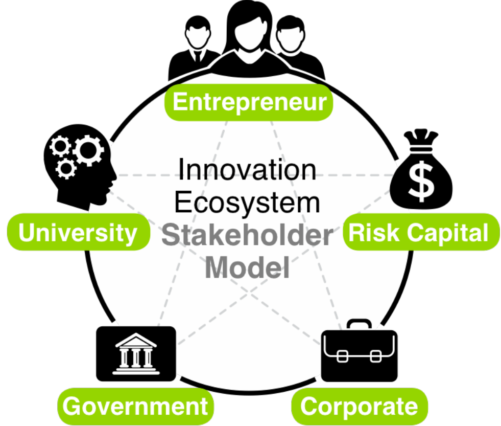
Exhibit 7: MIT REAP Innovation Driven Entrepreneurship Innovation Ecosystem Stakeholder Framework