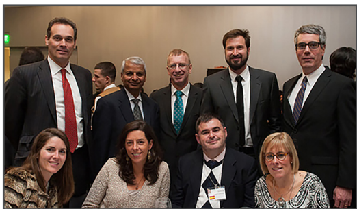
REAP Andalusia team members and MIT faculty.